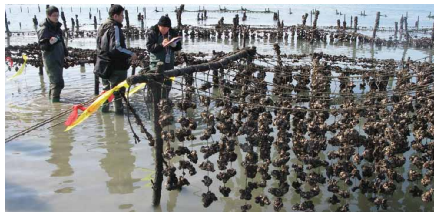
Local experts engaged by the 1992 Fund surveying pollution damage to oyster farms following the Hebei Spirit incident (Republic of Korea)